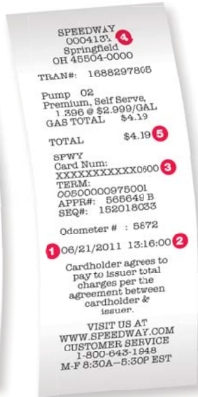
Pay at the Pump Receipt

• Pump will prompt for receipt at time of purchase